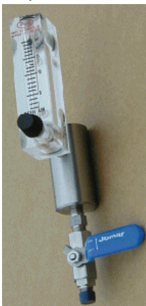
PN 13123 Remote Mounting Assembly

For best results, the sensor should be mounted directly in the measured gas line. This will ensure that it remains in a low-dew atmosphere which will decrease the measurement response time. The sensor is fitted with 5/8-18 UNF Male threads. If the sensor is not going to be mounted directly in the gas stream, it should be installed in the Remote Mounting Assembly (SSi Part Number 13123), which can be purchased separately. Although this installation does allow for some design flexibility, it is important that only stainless steel tubing and fittings are used to carry the sample gas to the sensor. When installing the unit, verify that all fittings are tight, since any leaks will cause inaccurate readings.