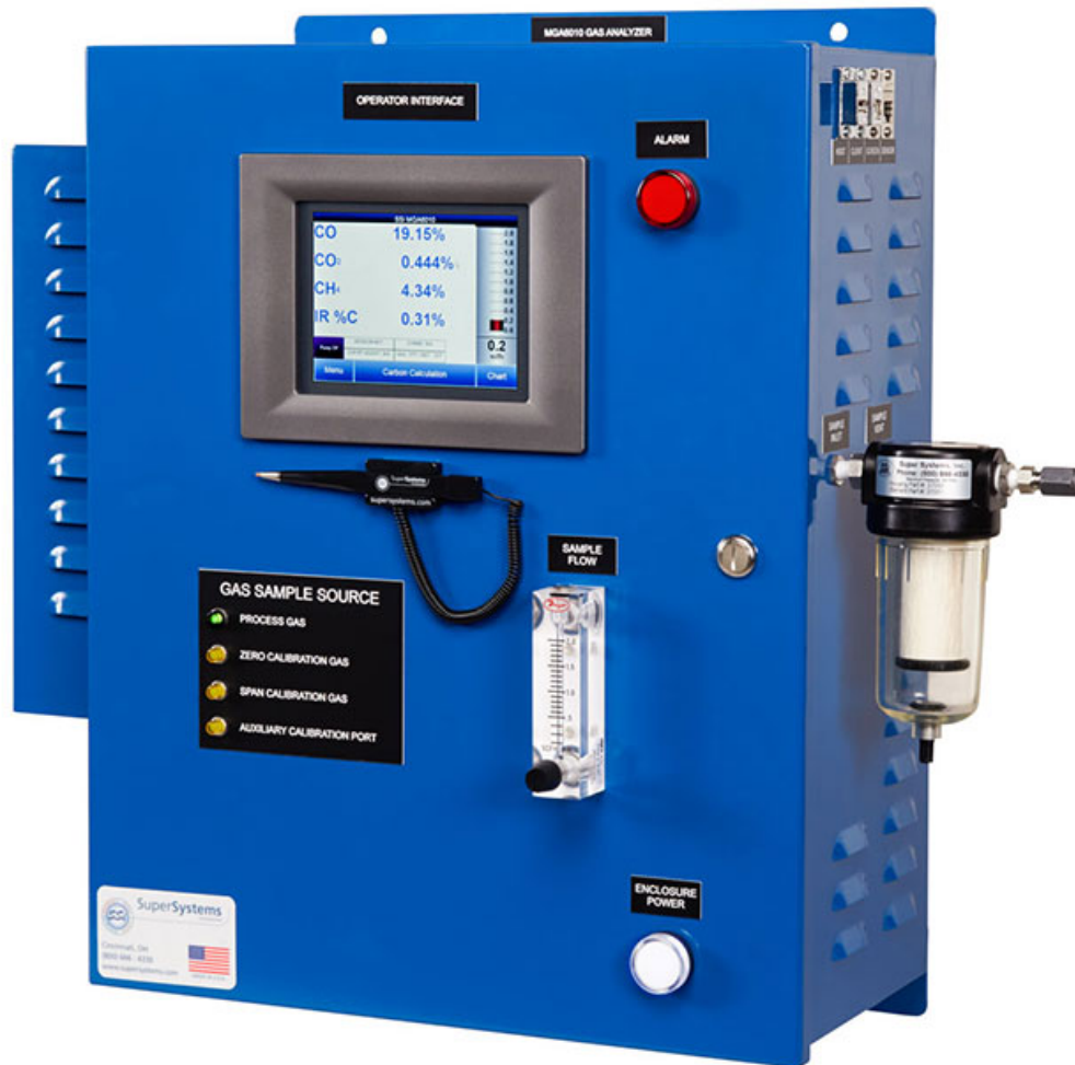
MGA6010 3 Gas Analyser